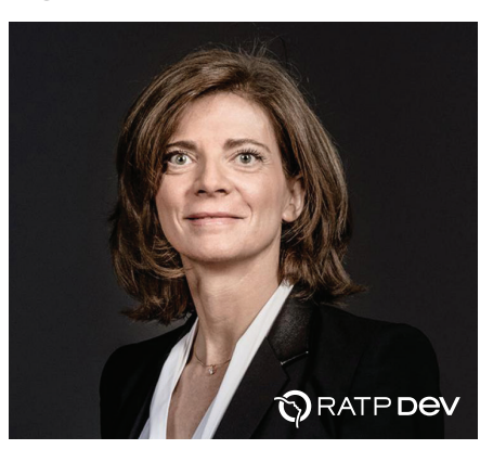
Laurence Batlle President of the Executive Board at RATP Dev

RATP Dev is also a signatory of the <u>Women's Empowerment Principles (WEP)</u>, within the framework of the United Nations Global Compact. The Women's Empowerment Principles are a set of seven principles offering guidance to businesses on how to promote gender equality and women's empowerment in the workplace, marketplace, and community<sup>1</sup>.